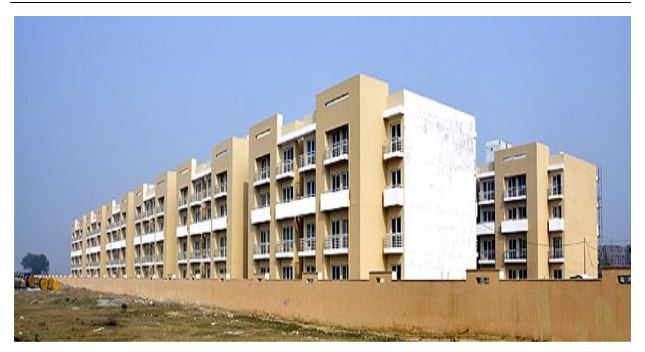
BPTP PARK FLOORS - II (Faridabad)