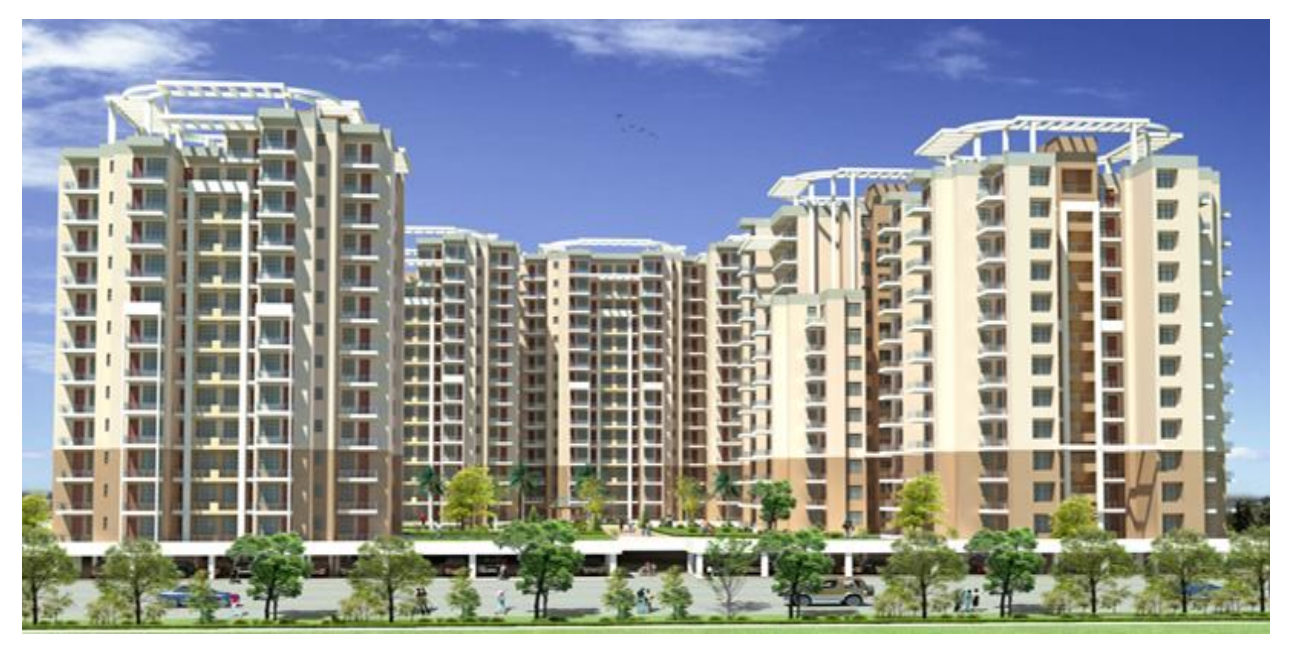
KLJ HEIGHTS (Bahadurgarh)