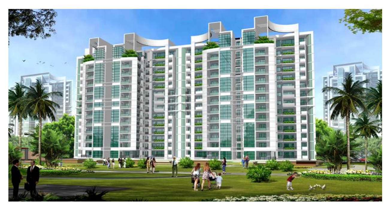
SPAZE PRIVY (Gurgaon)