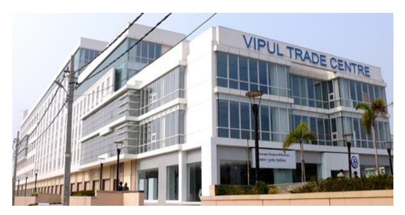
VTPUL TRADE CENTER (Gurgaon)