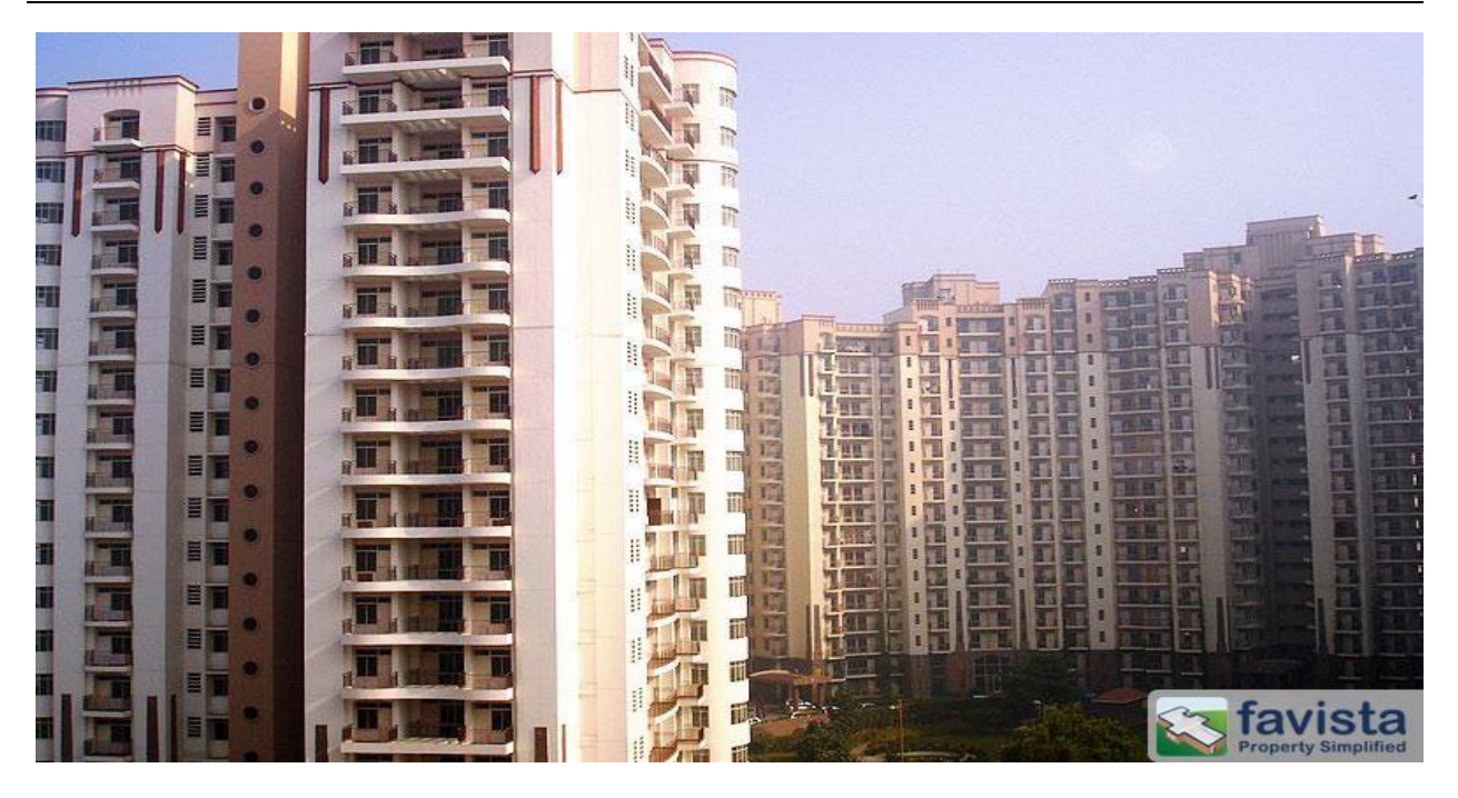
ESSEL TOWERS (Gurgaon)