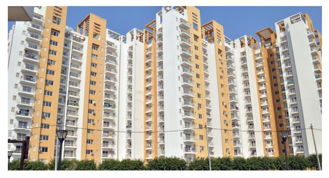
BPTP PARK GRANDEURA (Faridabad)