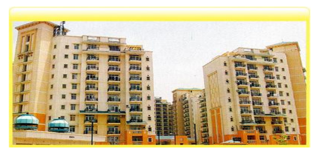
SUNCITY HEIGHTS ( Gurgaon )