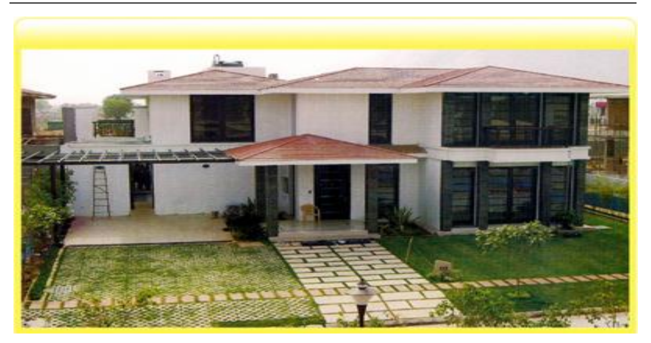
VIPUL TATVAM VILLAS (Gurgaon)