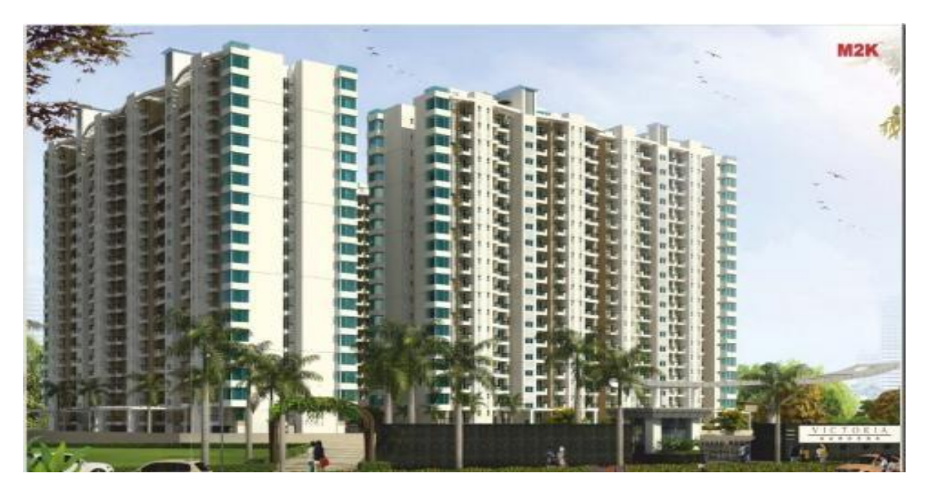
M2K VICTORIA GARDENS (New Delhi)