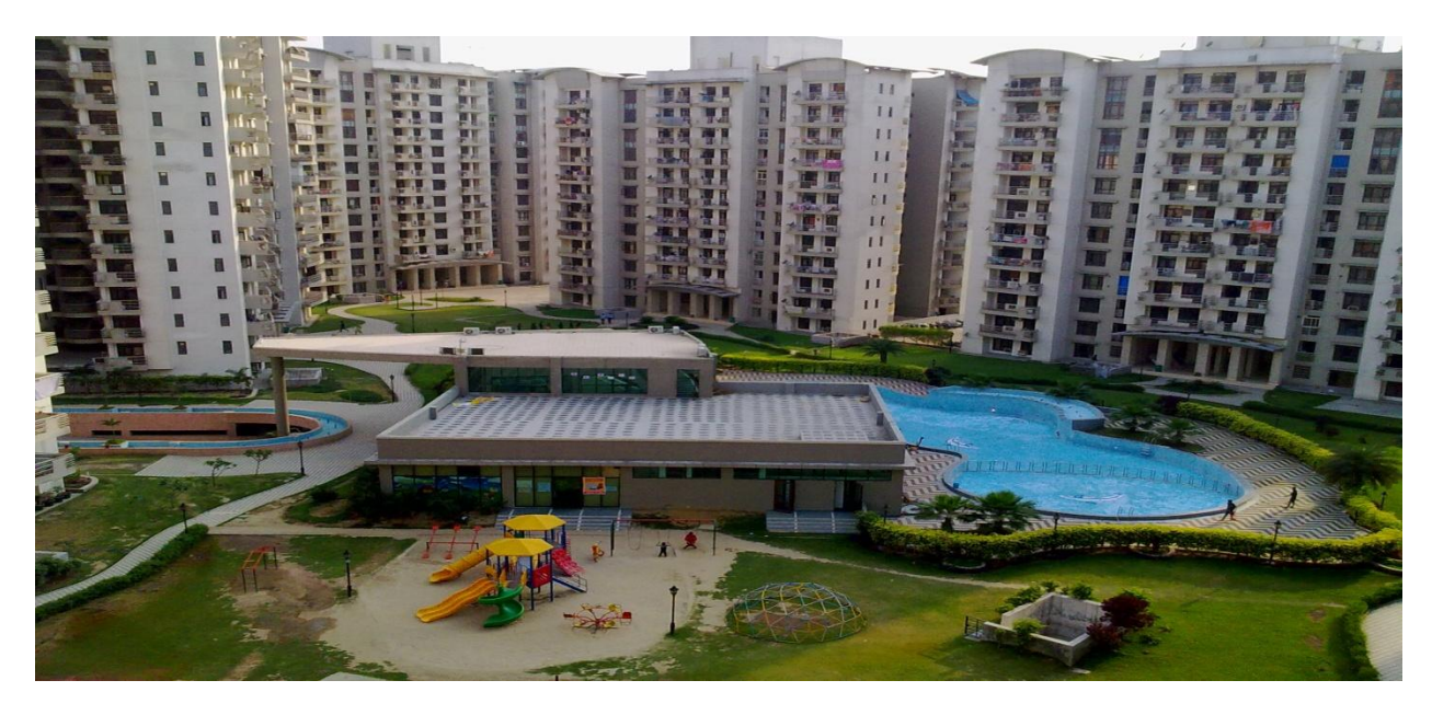
KRISHNA APRA GARDENS ( INDIRAPURAM)