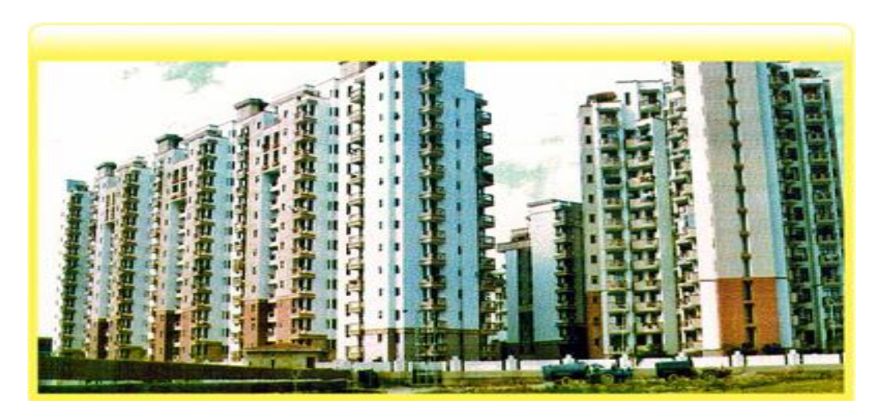
VIPUL GARDENS ( Gurgaon )